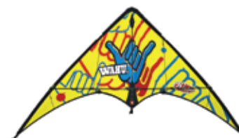
Rebel Wahu stunt kite $34.99