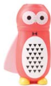
Cotton On Kids Animal torch $4.95

Spoil the little ones in your life for less this Christmas with these affordable stocking fillers. Boys and girls of all ages will love these fun and trendy gift ideas.