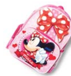
Best & Less Mini Mouse backpack $25