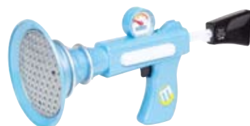
The Reject Shop Blow out horn $10