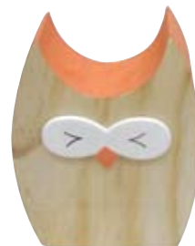
MyHouse Hoot owl $9.95