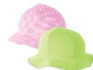
Pumpkin Patch Stripe hat $16.99