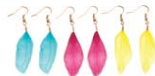
Lovisa Feather earrings $12.99