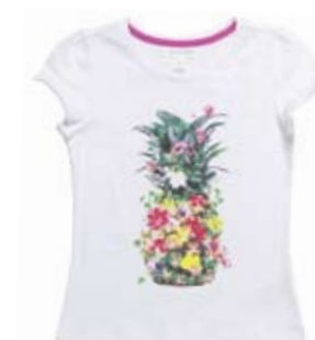
Pumpkin Patch Pineapple graphic tee $26.99