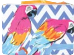
Cotton On Breaking News pouch $12.95