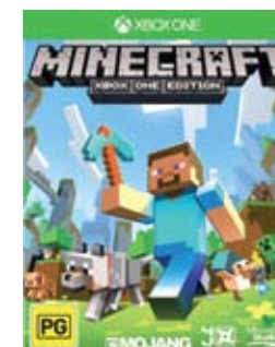
EB Games Minecraft - Xbox One edition $29.95