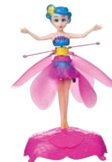
The Reject Shop Smart sensor flying doll $20