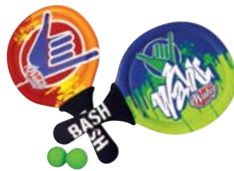
Rebel Wahu beach bash $19.99