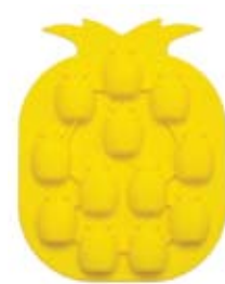
Colette by Colette Hayman Pineapple ice tray $7.95