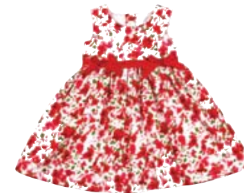
Blue Sky Kids Cotton dress (0-4 yrs) $24.99