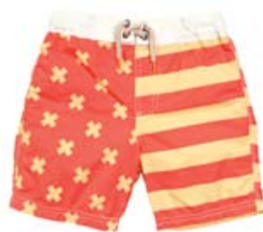
Cotton On Kids Bobby boardshort $19.95