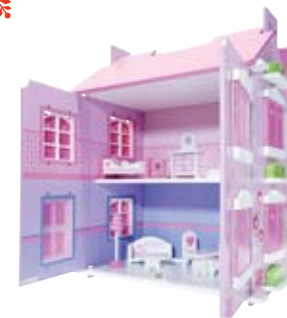
Kmart Wooden dollhouse $49