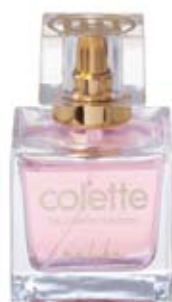
Colette by Colette Hayman 45ml perfume $19.95