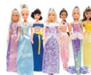
Kmart Seven pack fairytale princess collection $25