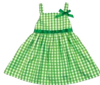
Blue Sky Kids Cotton dress $17.99