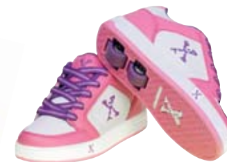
Kmart Sidewalk roller shoe $39