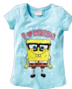
Big W Spongebob tee $12