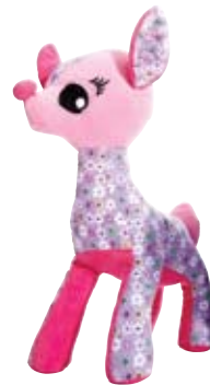
Kmart Plush animal toy $10