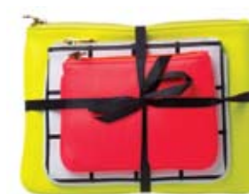
Colette by Colette Hayman Purse gift set $22.95