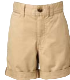
Jeanswest Shelby boys short $29.99