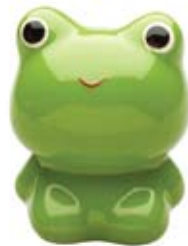
Daiso Ceramic frog money box $2.80