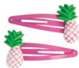
Pumpkin Patch Pineapple party clips $9.99