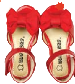
Blue Sky Kids Girls sandal $34.99