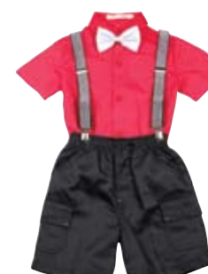
Blue Sky Kids Boys set $34.99