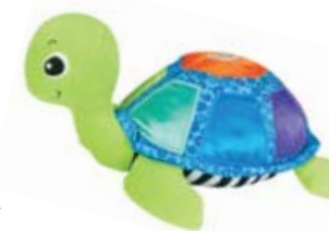
Big W Turtle Tunes $29.95