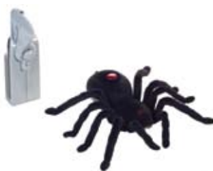
The Reject Shop Remote control spider $10

From Fairy Princesses to Xbox games, these gifts under $50 will leave a smile on the kids' faces come Christmas morning.