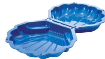
Kmart Sea n Sand pool $27